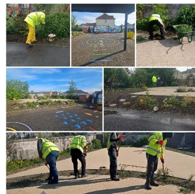
North West Kilmarnock