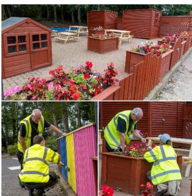
Kilmarnock Fire Station