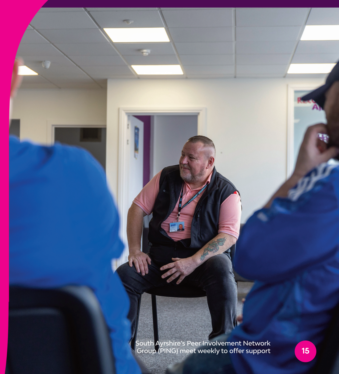
South Ayrshire's Peer Involvement Network Group (PING) meet weekly to offer support