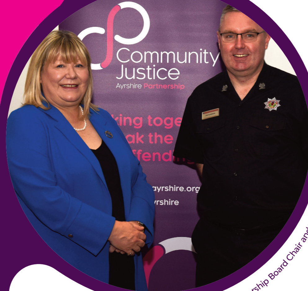
Community Justice Ayrshire Partnership Board Chair and Vice Chair

The CJAP is a pan-Ayrshire partnership working across East, North and South Ayrshire local authority areas. The CJAP Board provides strategic leadership and oversight of the work of the Partnership and is made up of both statutory and third sector partners.