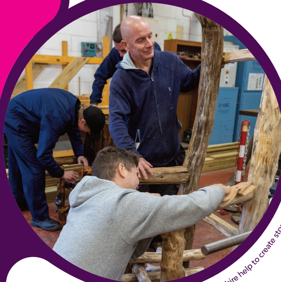
Unpaid Work Teams in North Ayrshire help to create storyteller chairs from driftwood