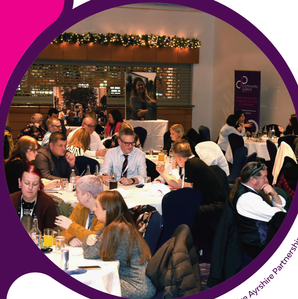
Delegates at the Community Justice Ayrshire Partnership conference in 2022

The Scottish Government published The Vision for Justice in Scotland in 2022. This document puts forth the evidence underpinning the approach to Community Justice, and prioritises 'women and children in justice', 'hearing victims voices' and 'shifting the balance between use of custody and justice in the community'.