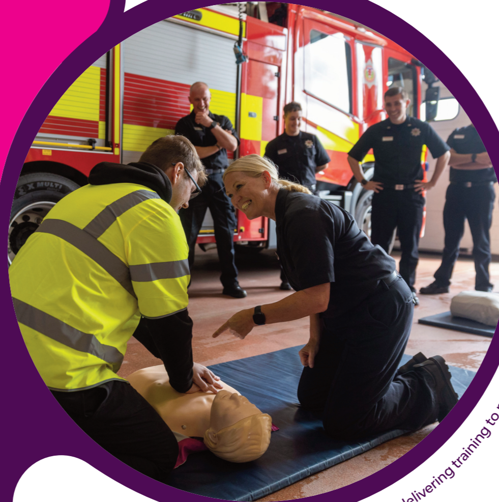
Scottish Fire and Rescue Service delivering training to people on Community Payback Order's

Community justice is principally about organisations working together to ensure that people who have offended address the underlying causes of their behaviour, and pay back to the community where appropriate.