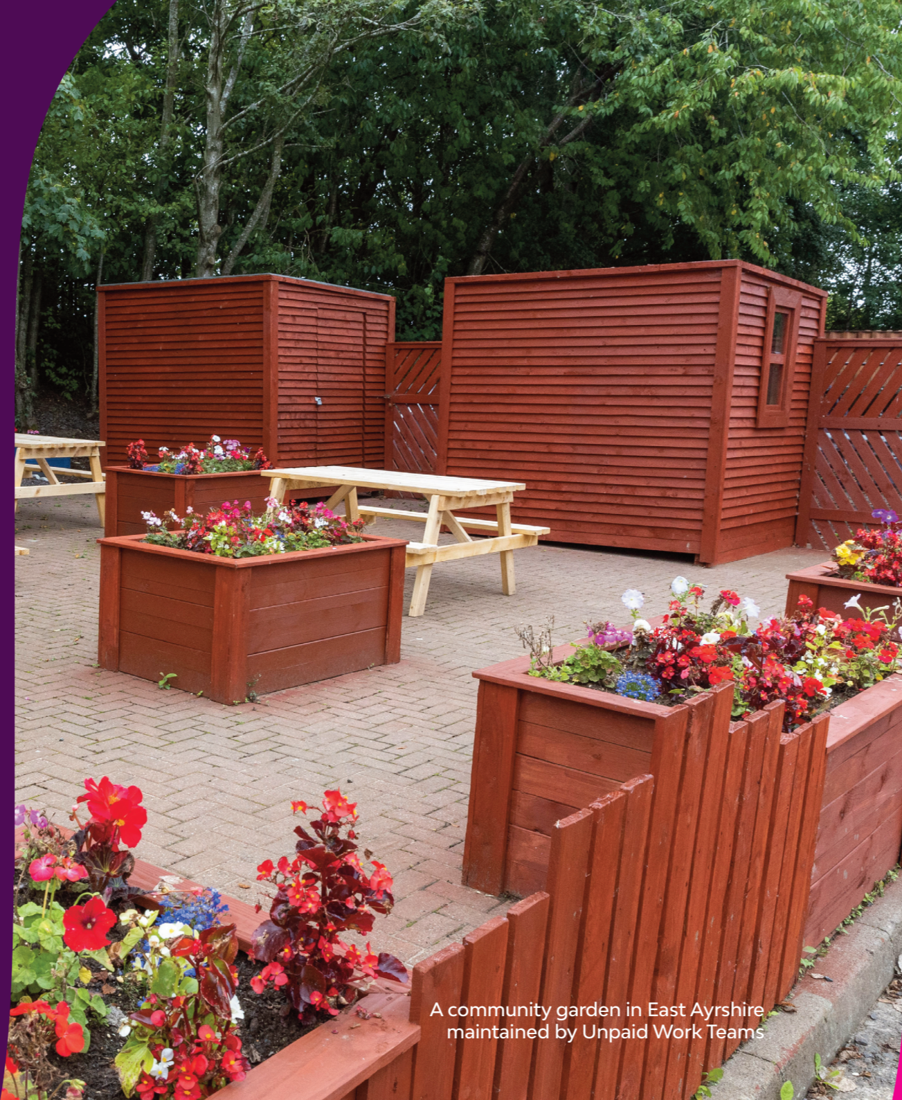
A community garden in East Ayrshire maintained by Unpaid Work Teams

A Communication and Engagement Strategy will sit beside this plan which will identify our stakeholders and who we will communicate and engage with, the ways in which we'll communicate and engage, and outlines the measures we will use to evaluate our success.