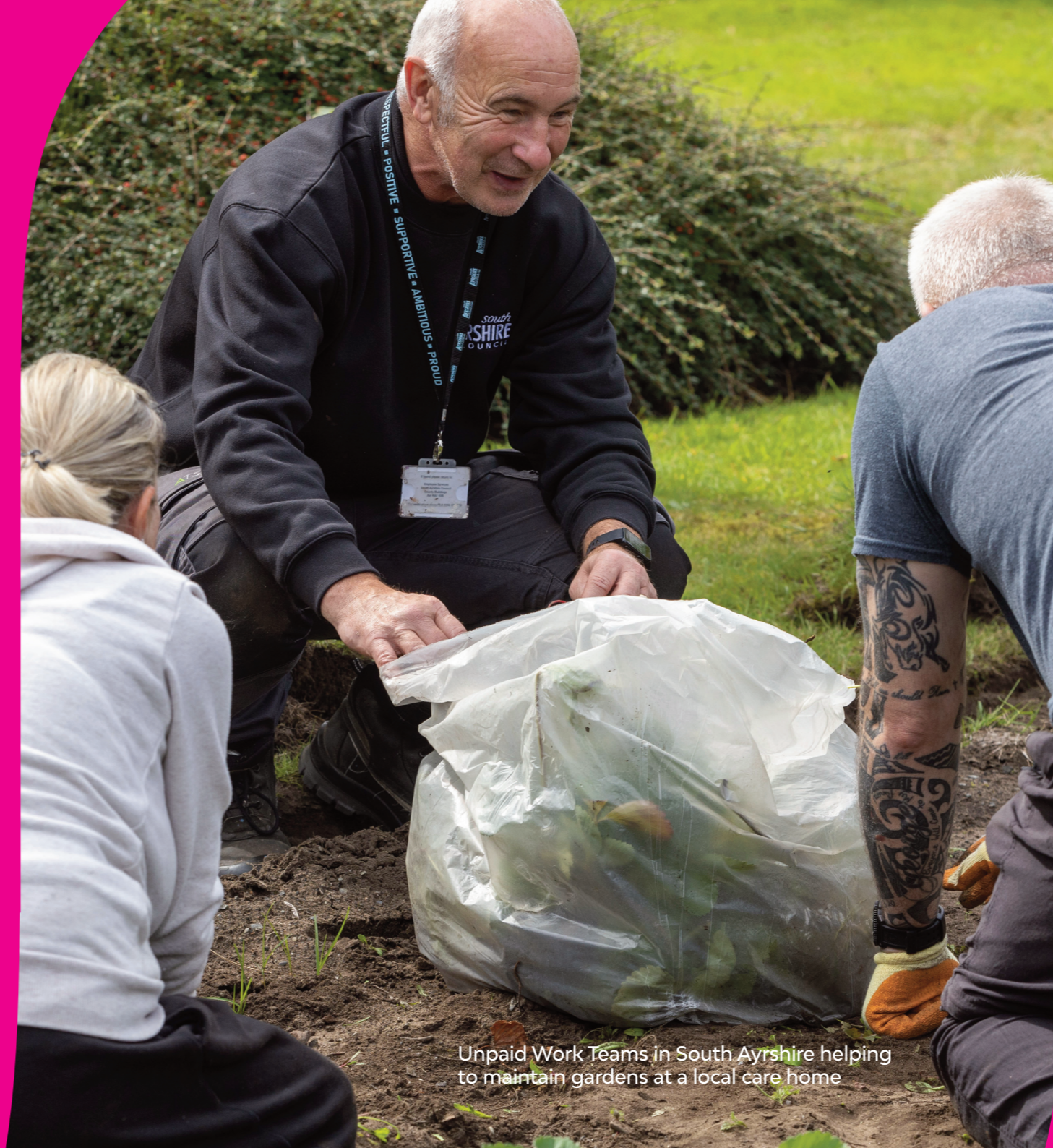
Unpaid Work Teams in South Ayrshire helping to maintain gardens at a local care home

The priority actions will remain unchanged for the duration of this CJOIP, however the deliverables identified to achieve each priority action will be reviewed annually to take account of completed activity, new demands, emerging issues of concern, feedback from people using justice services and to comply with legislative requirements.